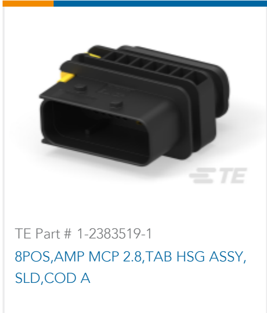
TE Part # 1-2383519-1 8POS,AMP MCP 2.8,TAB HSG ASSY, SLD,COD A