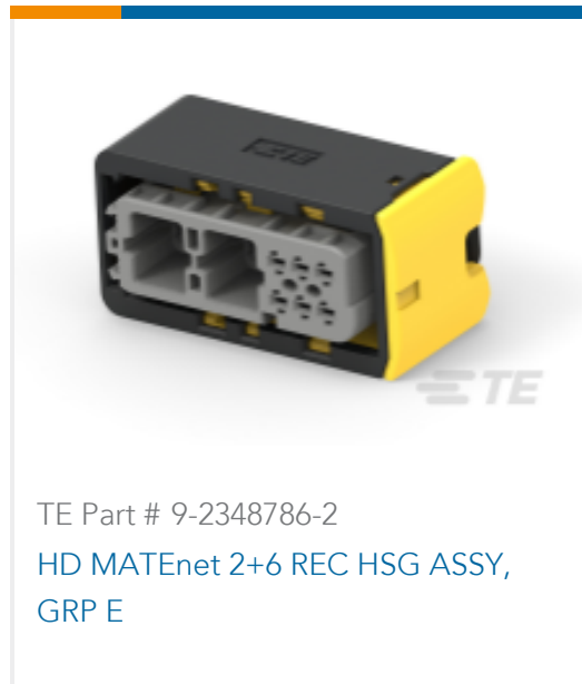
TE Part # 9-2348786-2 HD MATEnet 2+6 REC HSG ASSY, GRP E