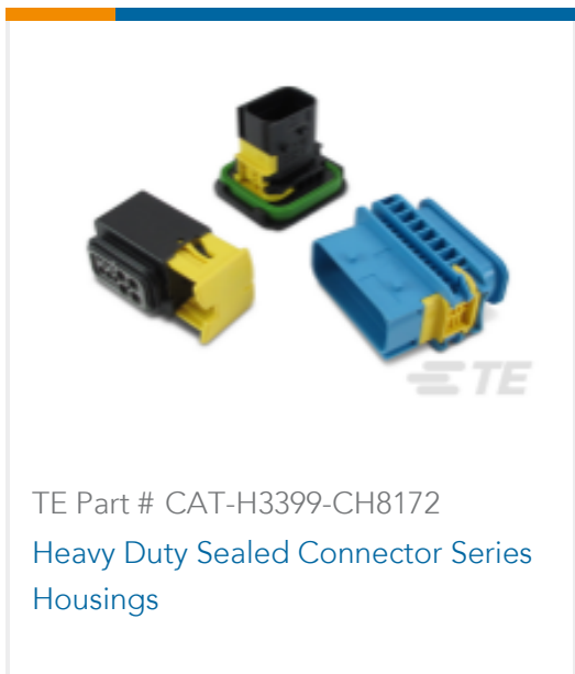
TE Part # CAT-H3399-CH8172 Heavy Duty Sealed Connector Series Housings