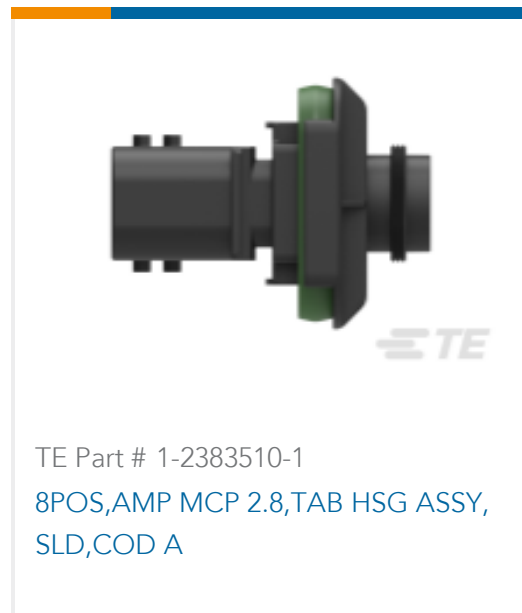
TE Part # 1-2383510-1 8POS,AMP MCP 2.8,TAB HSG ASSY, SLD,COD A