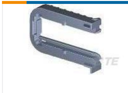
TE Part #1564411-1 SLIDE,TAB HSG GROUP E