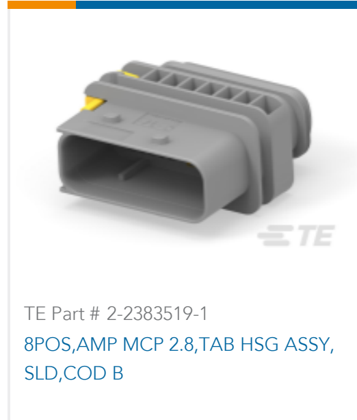
TE Part # 2-2383519-1 8POS,AMP MCP 2.8,TAB HSG ASSY, SLD,COD B