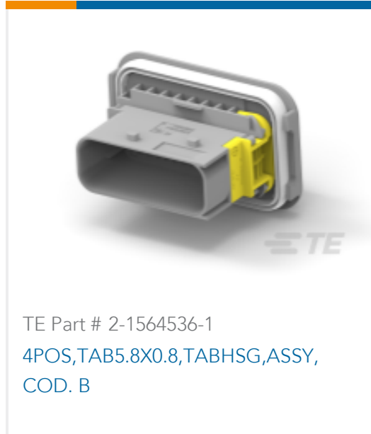
TE Part # 2-1564536-1 4POS,TAB5.8X0.8,TABHSG,ASSY, COD. B