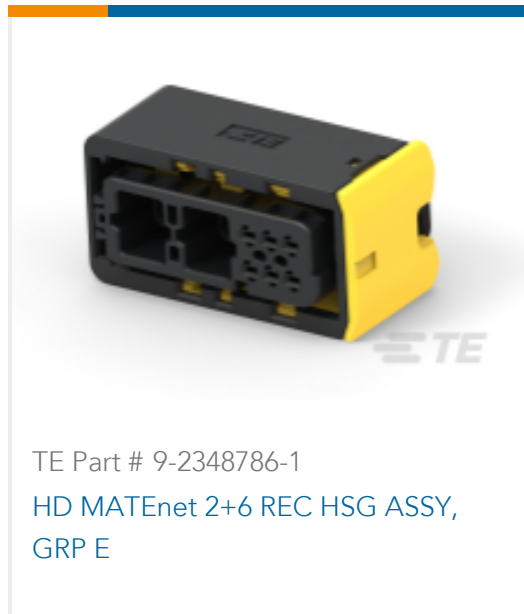
TE Part # 9-2348786-1 HD MATEnet 2+6 REC HSG ASSY, GRP E