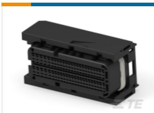
TE Part #2359941-6 96POS,MCON-1.2 CB,REC HSG,ASSY