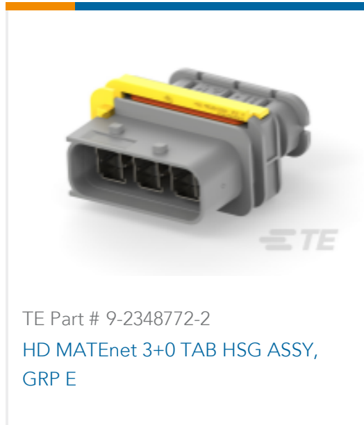
TE Part # 9-2348772-2 HD MATEnet 3+0 TAB HSG ASSY, GRP E