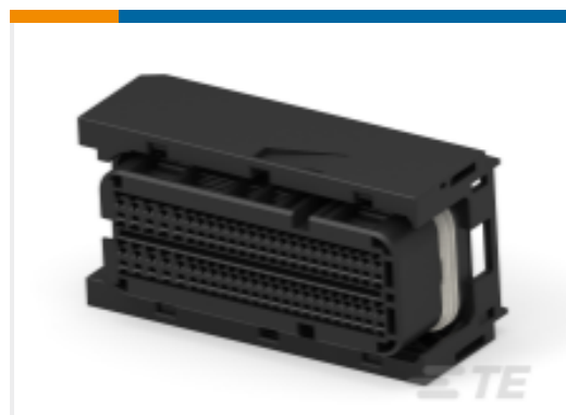
TE Part #2359943-2 96POS,MCON-1.2 CB,REC HSG,ASSY