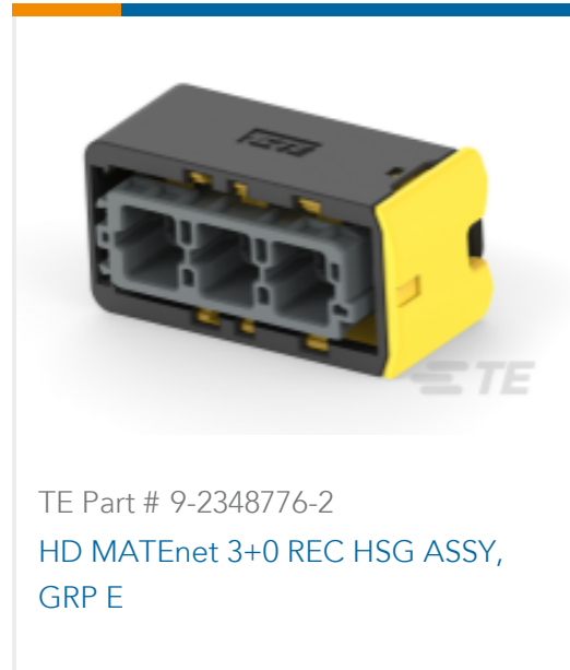
TE Part # 9-2348776-2 HD MATEnet 3+0 REC HSG ASSY, GRP E