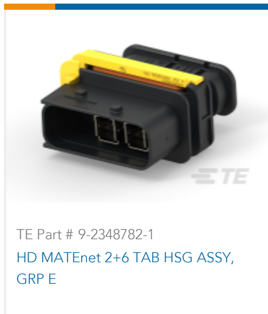
TE Part # 9-2348782-1 HD MATEnet 2+6 TAB HSG ASSY, GRP E