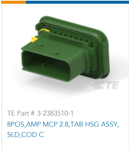
TE Part # 3-2383510-1 8POS,AMP MCP 2.8,TAB HSG ASSY, SLD,COD C