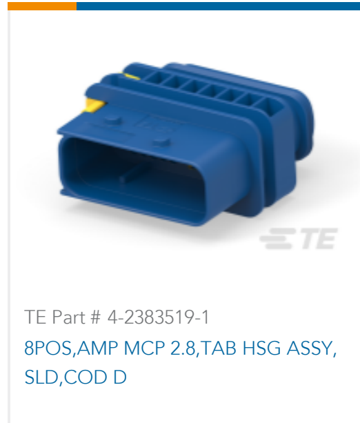
TE Part # 4-2383519-1 8POS,AMP MCP 2.8,TAB HSG ASSY, SLD,COD D