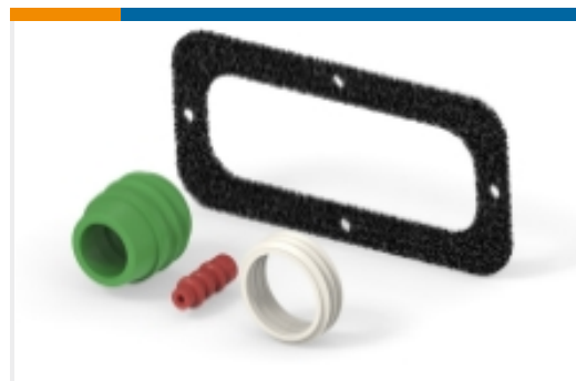
Connector Seals & Cavity Plugs(5)