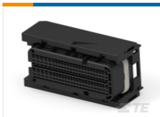
TE Part #2359943-1 96POS,MCON-1.2 CB,REC HSG,ASSY