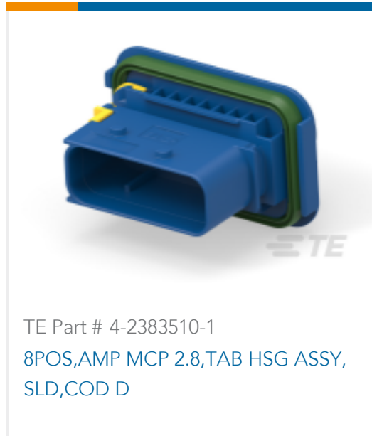
TE Part # 4-2383510-1 8POS,AMP MCP 2.8,TAB HSG ASSY, SLD,COD D