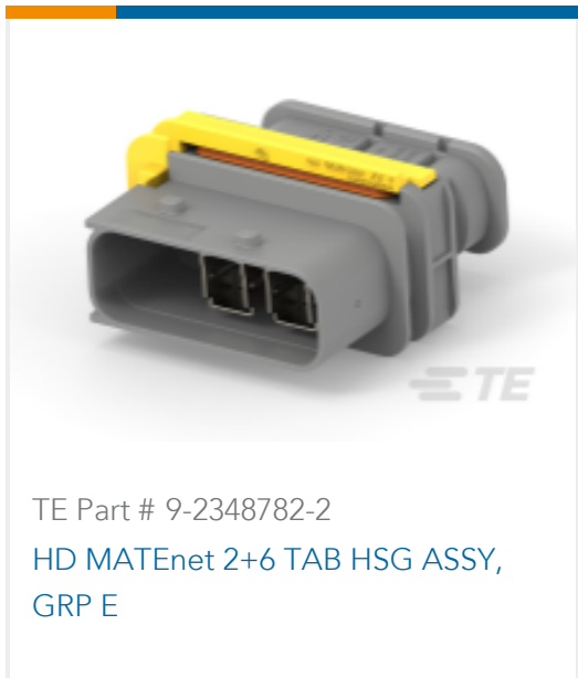
TE Part # 9-2348782-2 HD MATEnet 2+6 TAB HSG ASSY, GRP E