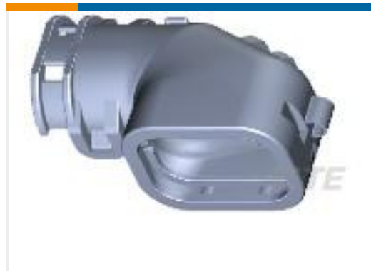
TE Part #1670057-1 COVER MIXED,90,CODA