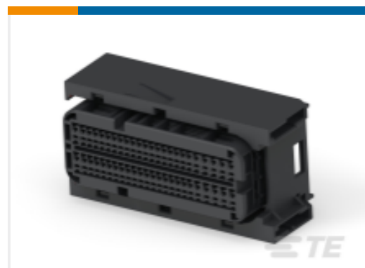
TE Part #8-1564284-5 96POS,MCON-1.2 CB,REC HSG,ASSY