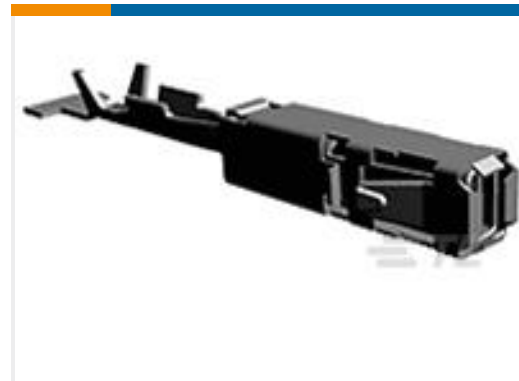
TE Part #1241380-1 AMP MCP 1.5K, CONTACT, SWS