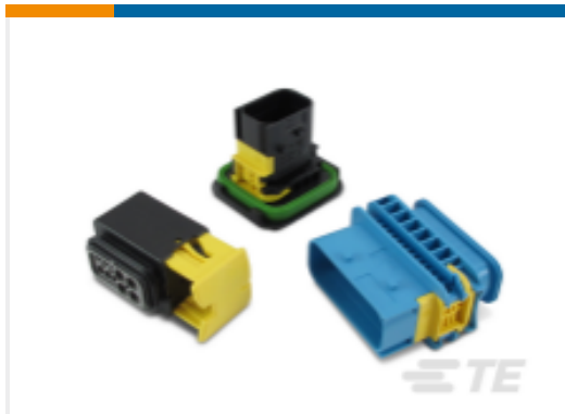
TE Part #1-1564526-1 Heavy Duty Sealed Connector Series Housings