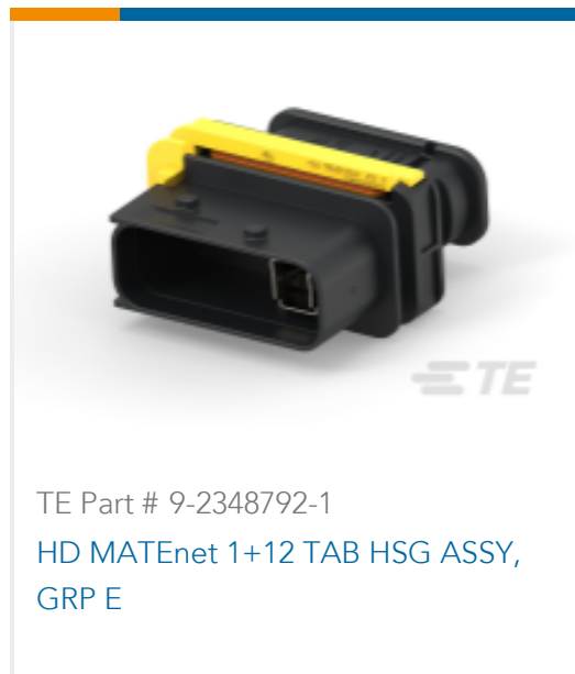
TE Part # 9-2348792-1 HD MATEnet 1+12 TAB HSG ASSY, GRP E