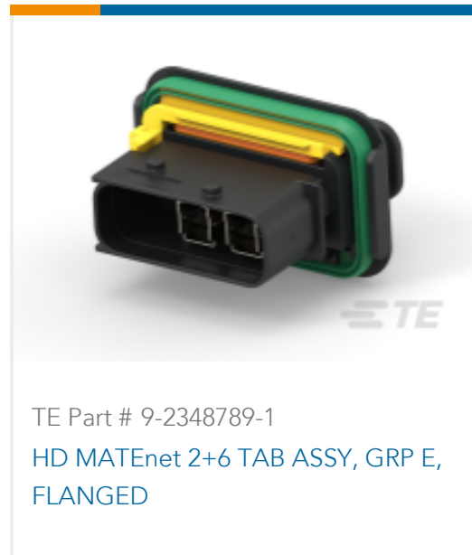
TE Part # 9-2348789-1 HD MATEnet 2+6 TAB ASSY, GRP E, FLANGED