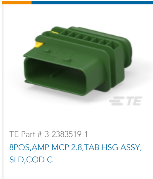
TE Part # 3-2383519-1 8POS,AMP MCP 2.8,TAB HSG ASSY, SLD,COD C