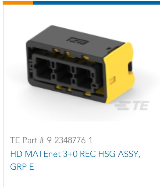
TE Part # 9-2348776-1 HD MATEnet 3+0 REC HSG ASSY, GRP E