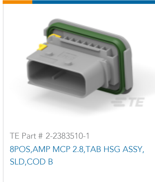
TE Part # 2-2383510-1 8POS,AMP MCP 2.8,TAB HSG ASSY, SLD,COD B