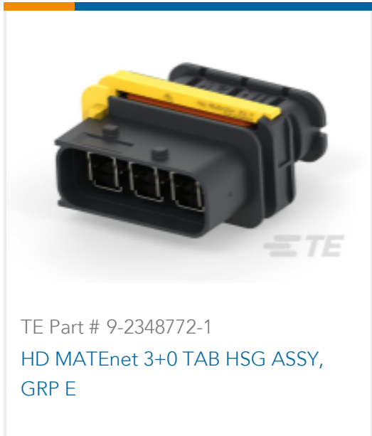
TE Part # 9-2348772-1 HD MATEnet 3+0 TAB HSG ASSY, GRP E