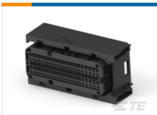
TE Part #8-1564284-6 96POS,MCON-1.2 CB,REC HSG,ASSY