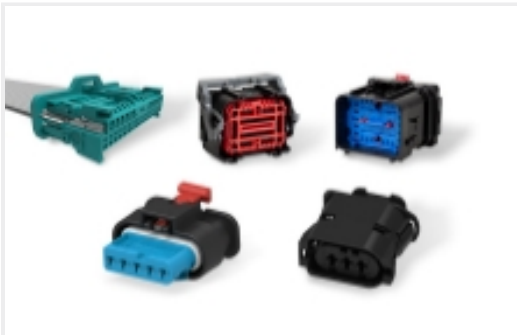
Automotive Signal & Power Connector Housings(136)