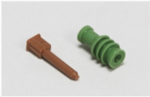
Automotive Seals & Cavity Plugs(32)