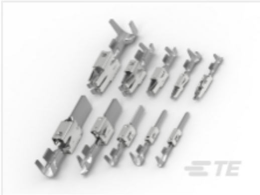
TE Part #CAT-T4827-T273 TIMER, RECEPTACLE AND TAB