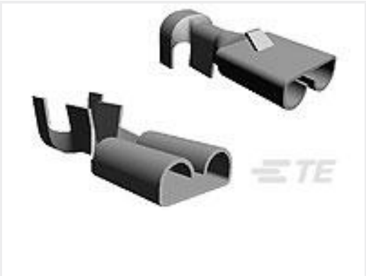
TE Part #180384-2 FF 250 REC 4-6MM2 PTBR LP