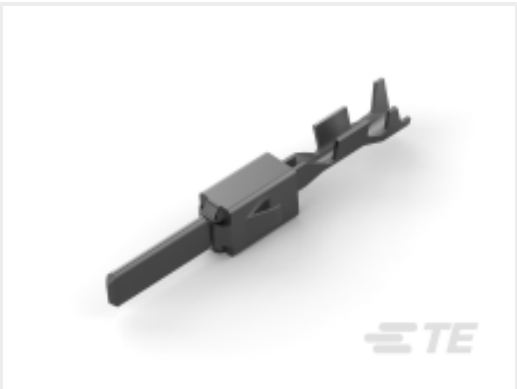
TE Part #1-963745-1 SPECIAL TERMINAL 20-17 AWG PTPB LP