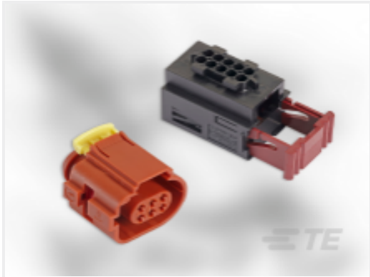
TE Part #CAT-T4827-CH8172 Timer Connector Housing