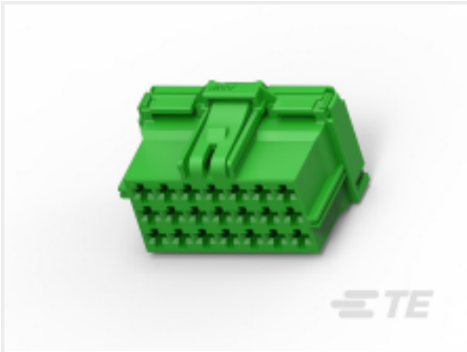
TE Part #CAT-AM705-CH8173 AMP Unsealed Connector Housing