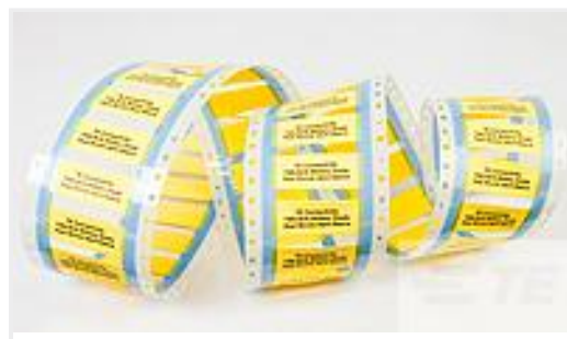
TE Part #0937690001 TMS-SCE-3/8-2.0-S1-9