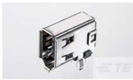
TE Part #5787956-1 SOCKET ASSY IEEE1394