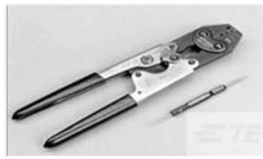
TE Part #959025-000 AD-1377-S-SPEC-CRIMP-TOOL