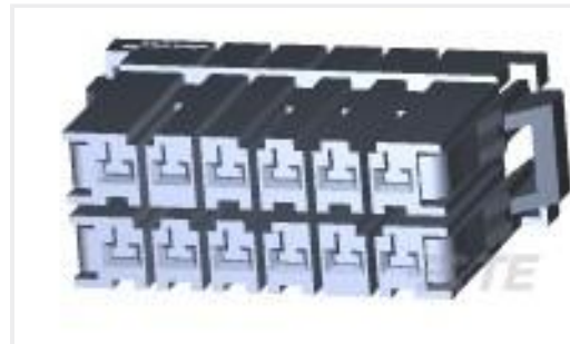
TE Part #3-917659-6 DYNAMIC 3200 D/ROW REC HSG 12P