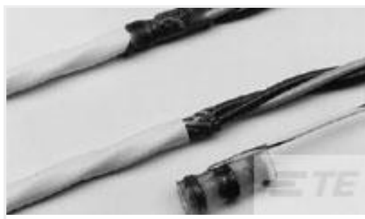
TE Part #775210-000 S01-03-R