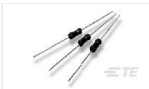
TE Part #7-1625890-3 2W SM M/OX 5% 8R2