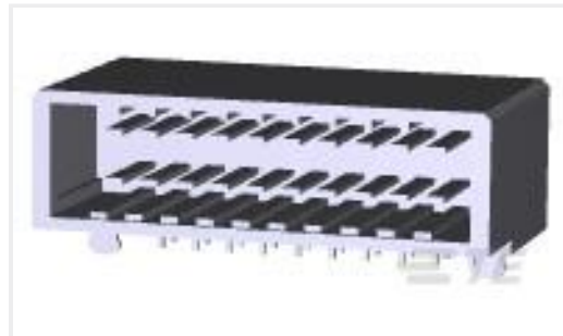
TE Part #178308-2 DYNAMIC D-3 HDR ASSY H 20P PdNi PL