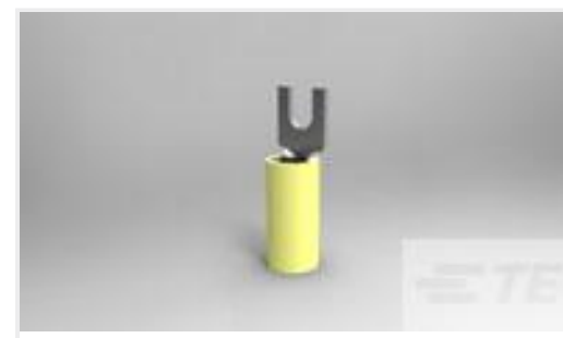
TE Part #53115-2 TERMINAL,PIDG SPD 26-24 6