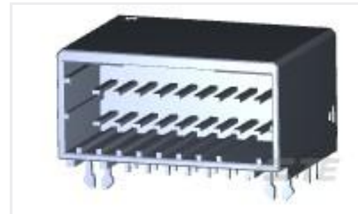
TE Part #1376137-2 DYNAMIC D2100 HDR H ASSY 20P Y