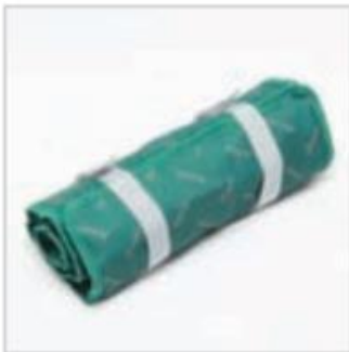
600D tool roll bag: 305x635mm